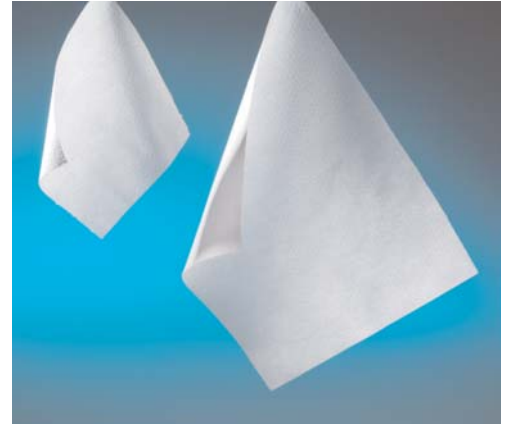
CaviWipes are now in 2 sizes: regular and extra large.